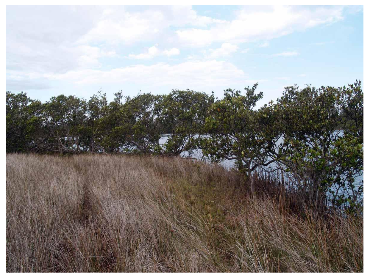
Photo 7 Estuarine Mangrove Forest fringing Badgee Lagoon, with Estuarine Saltmarsh in the foreground

This community does not form part of any listed "endangered ecological community".