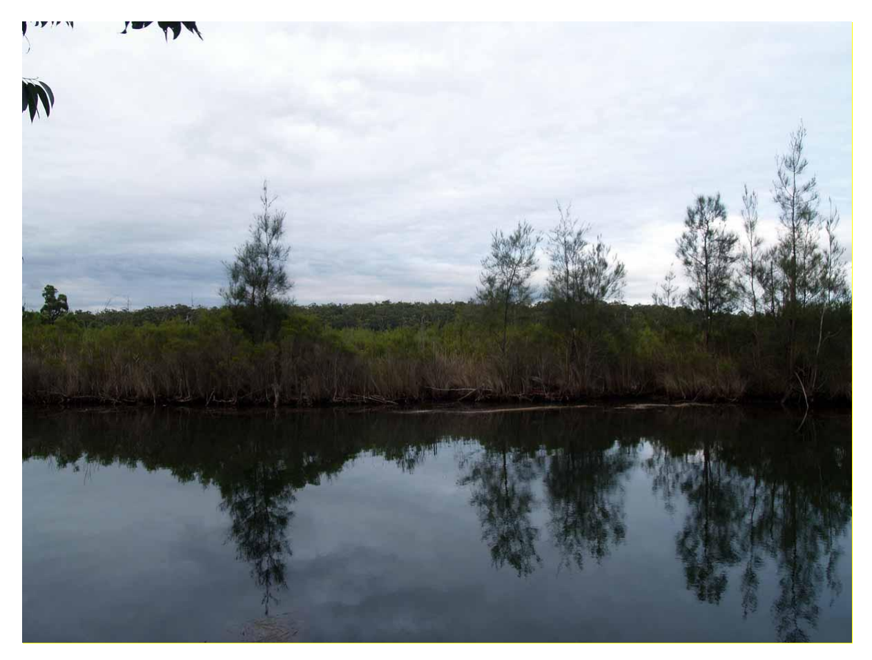
Photo 6 Estuarine Creek-flat Scrub in the upper reaches of Badgee Lagoon

This vegetation conforms to the "endangered ecological community" listed as Swamp Scleroplyll Forest on Coastal Floodplains (SSFCF), as discussed in detail in Chapter 4.3 of this Report .