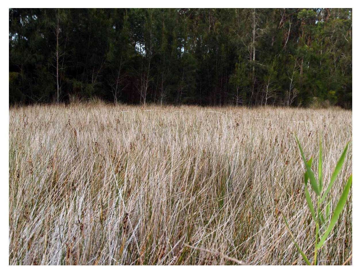
Photo 8 Estuarine Saltmarsh, with Estuarine Fringe Forest in the background

This vegetation type clearly conforms to the " endangered ecological community " listed as Coastal Saltmarsh, as discussed in detail in Chapter 4.3 of this Report .