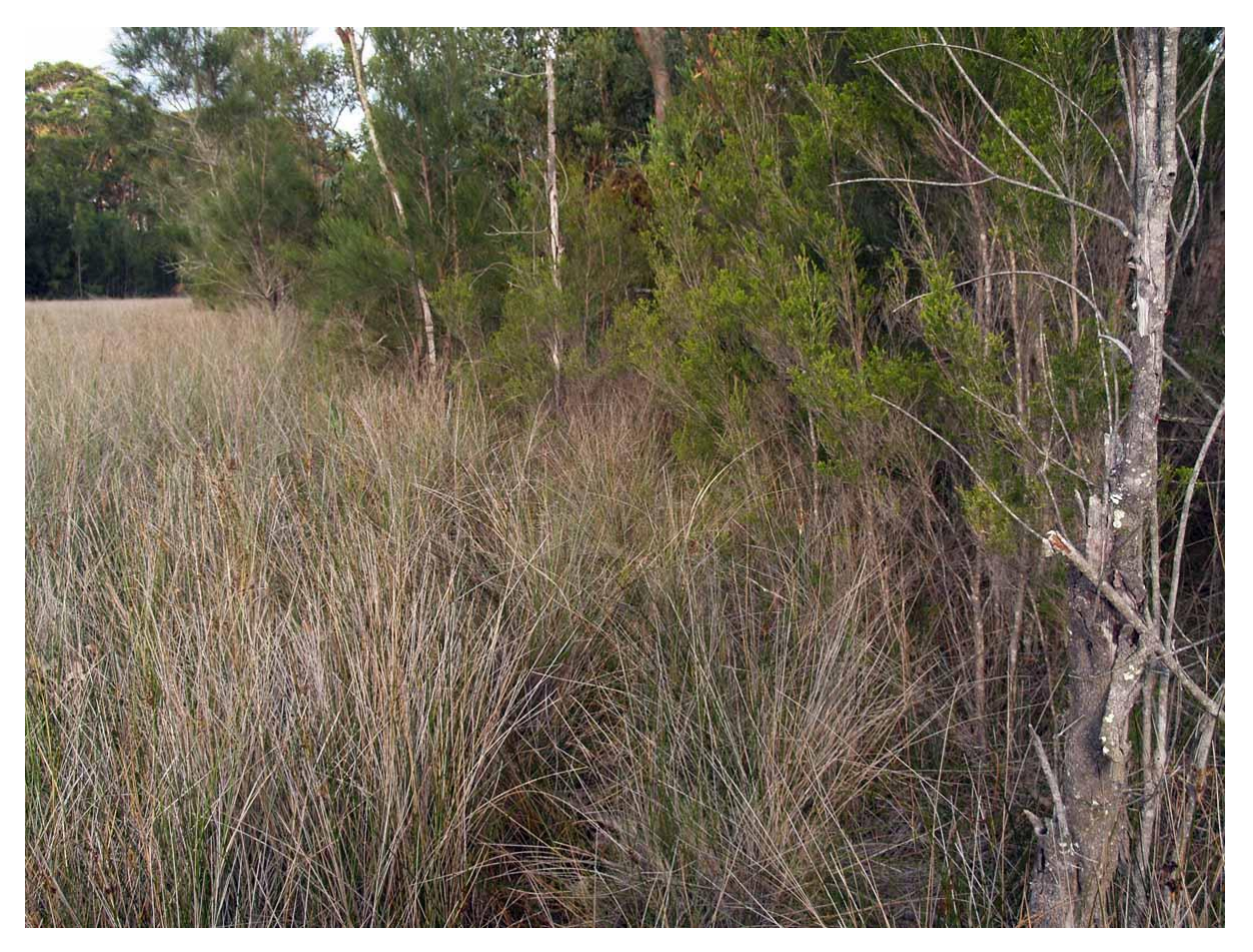
Photo 5 Estuarine Fringe Forest (right and background), with Estuarine Saltmarsh in the left.

This community conforms to the " endangered ecological community " listed as Swamp Oak Floodplain Forest (SOFF), as discussed in detail in Chapter 4.3 of this Report .